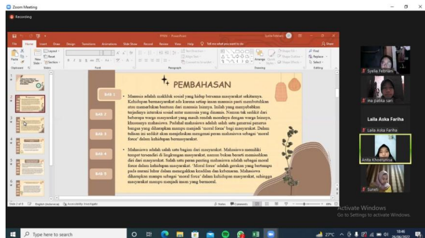
Figure 2. PKM material presentation activities to participants

Meanwhile, related to the media used in this activity, the media zoom meeting with the method of delivering material is the lecture method and discussion between the Resource Group and participants. This activity consists of one session with a system of combining material delivery and discussion.