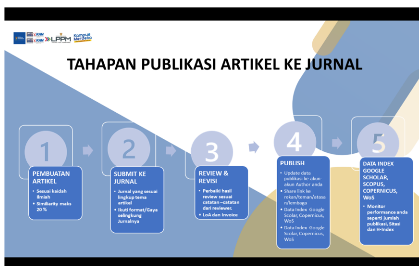
Fig 4. Slide of Presentation

The better the research topic, the more interesting the article containing the results of the research. This will make it easy for journal editors to glance at and accept. So that it is easier to publish and in a relatively short period of time. The way to find research ideas is to read other people's work either in the form of journal articles, accompanied by a thesis or some kind of research report. There may be parameters that have not been fully studied, differences in location, methods or research objects may produce different findings. Studying a certain theory and want to compare it with the reality in the field. Hearing information from the media & scientific seminars, natural events, community conditions, or complaints can inspire research. Seeing directly the phenomenon in the field. The way to find research ideas is to develop Student Thesis/Thesis Topics, Collaborate with students to compile the assignment of an article related to the subject being taught, Develop other authors' articles and Collaborate with other lecturers