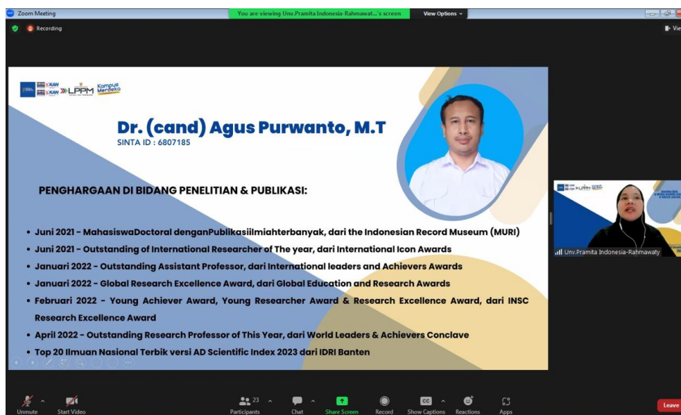
Fig 2. Speaker Profile

Writing Scientific Publications has many benefits, including scientific publications that can become a track record of research as academics. The more scientific journals cited, the better the reputation of researchers. This is especially important for researchers who work as lecturers Contributing to the development of science With publication through scientific journals, it is hoped that it can increase the development of science in the development of certain fields of science Apart from being useful as a track record of competence, scientific publications can be a portfolio if you wish to register scholarships or continue their studies to a higher level.