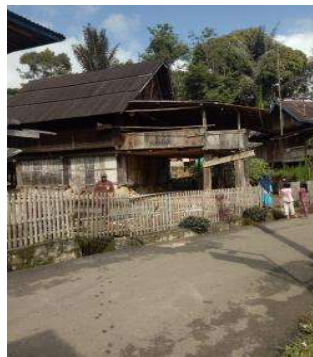
Picture1.: Desa Pulau Panggung

Since March 3, 2020, the COVID-19 pandemic has hit Indonesia circumstances began to change as a result of the effects of one of these new diseases, ranging from economic, educational, social, work and many others feel the impact of the pandemic. In the Presidential Decree (Keppres) Number 7 In 2020, the Task Force for the Acceleration of Handling Covid-19 was formed chaired by Doni Monardo as Head of the Disaster Management Agency. (source: iNews.id)