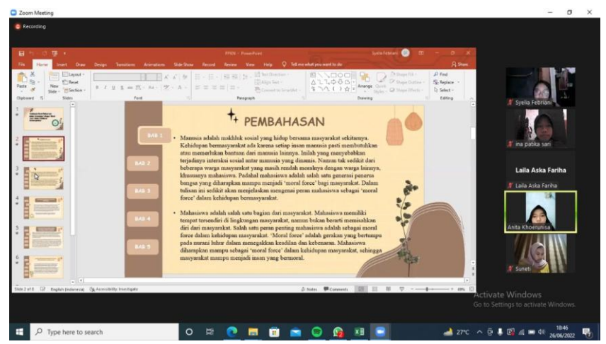
Figure 2. PKM material presentation activities to participants

Meanwhile, related to the media used in this activity, the media zoom meeting with the method of delivering material is the lecture method and discussion between the Resource Group and participants. This activity consists of one session with a system of combining material delivery and discussion.