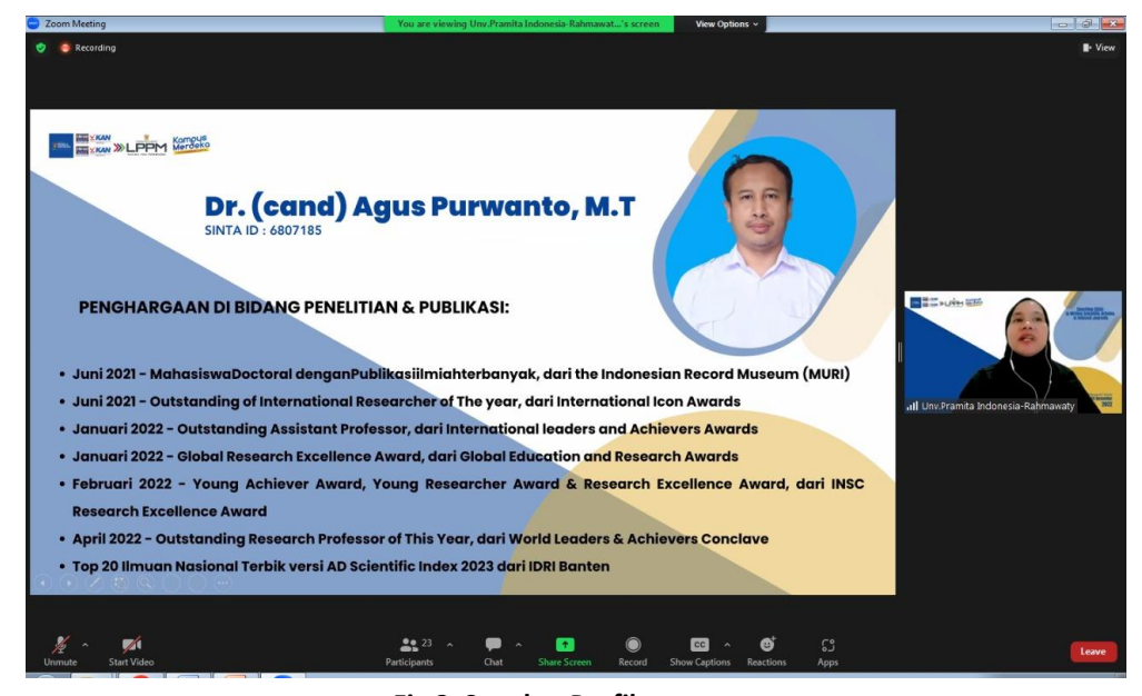
Fig 2. Speaker Profile

Writing Scientific Publications has many benefits, including scientific publications that can become a track record of research as academics. The more scientific journals cited, the better the reputation of researchers. This is especially important for researchers who work as lecturers Contributing to the development of science With publication through scientific journals, it is hoped that it can increase the development of science in the development of certain fields of science Apart from being useful as a track record of competence, scientific publications can be a portfolio if you wish to register scholarships or continue their studies to a higher level.