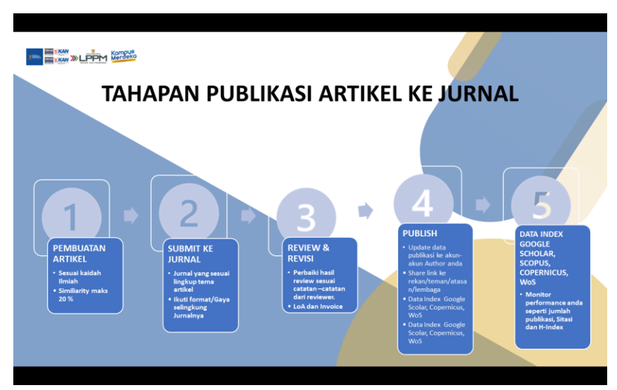
Fig 4. Slide of Presentation

The better the research topic, the more interesting the article containing the results of the research. This will make it easy for journal editors to glance at and accept. So that it is easier to publish and in a relatively short period of time. The way to find research ideas is to read other people's work either in the form of journal articles, accompanied by a thesis or some kind of research report. There may be parameters that have not been fully studied, differences in location, methods or research objects may produce different findings. Studying a certain theory and want to compare it with the reality in the field. Hearing information from the media & scientific seminars, natural events, community conditions, or complaints can inspire research. Seeing directly the phenomenon in the field. The way to find research ideas is to develop Student Thesis/Thesis Topics, Collaborate with students to compile the assignment of an article related to the subject being taught, Develop other authors' articles and Collaborate with other lecturers