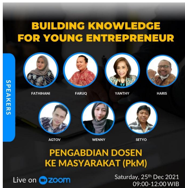
Figure 1. Activity Flyer